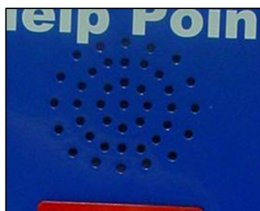
FULL CIRCLE SPEAKER HOLES